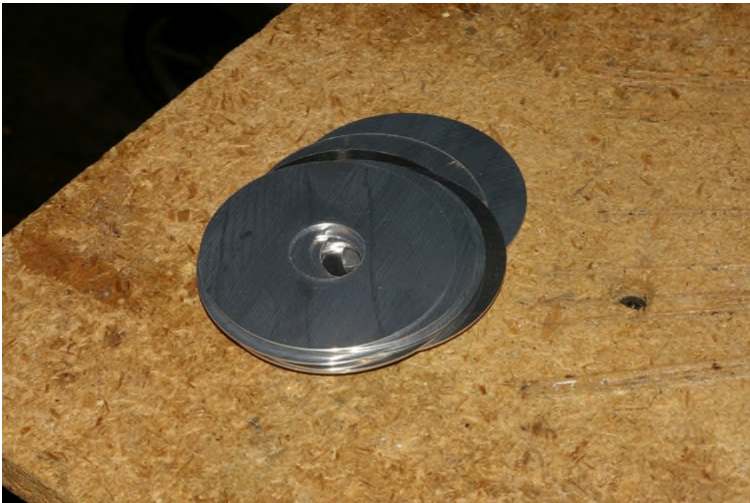
Disks ready for forming