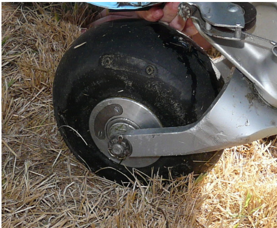
Can anyone tell me the differences on Seabee Tailwheels?