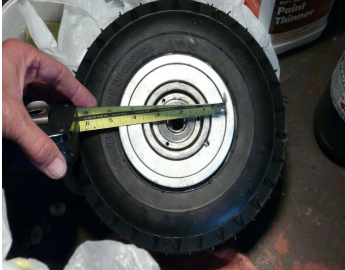
Now, this is a totally different looking wheel on Tom's Bee.