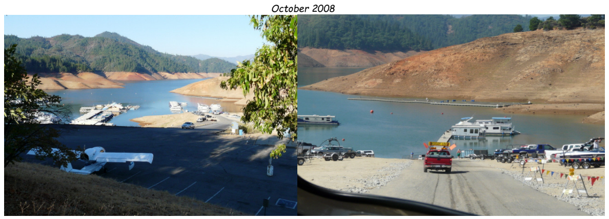
Bridge Bay Resort, Lake Shasta, California enroute to Clear Lake