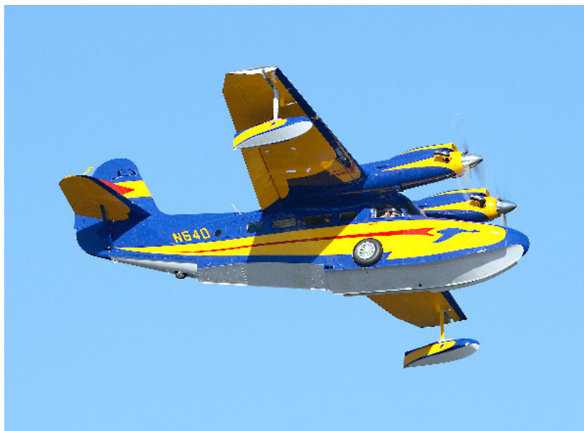
taken at Clear Lake Splash-in 2006

Due to time and resources, mine, I've combined the two newsletters. Most of the Seabee specific stuff, Products and Experts, etc. are at the end of the newsletter.